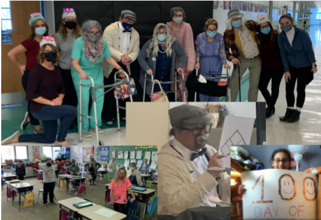
Prairie View Students and Staff celebrating the 100th Day of School

This is a reminder to participate in the parent survey supplement, part of the Illinois 5Essentials Survey administration. We guarantee that survey responses will never be connected to the identity of you or your child. School reports will only present aggregated information of how parents and students responded as a whole.